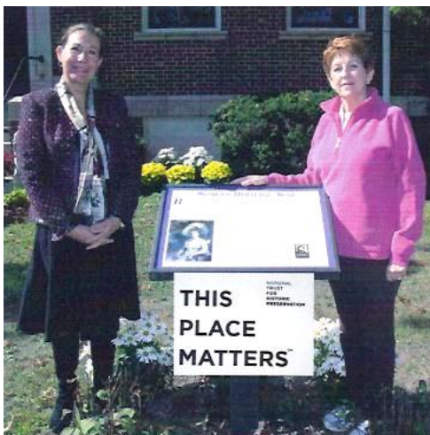
Copies of the book, State of New Jersey Women's Heritage Trail , can be purchased at the Museum.